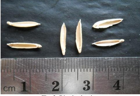
Fig. 2. Rice husks size.

Unsaturated polyester Yukalac 157 BQTN, and methyl ethyl ketone peroxide (MEKPO) were used as matrix components. Polyester and hardener 1% volume were mixed in a container and stirred to form matrix. Then the rice husks were poured gradually and stirred well to make mixture of fibers within the matrix homogeneous. Then the mixtures were poured into the mould. The composites with the variation of fiber weight fraction 20, 30, 40 and 50% were made by hand lay up techniques. The curing time was about 2 hours at temperature 65 °C. Finally, composites plates were