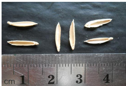
Fig. 2. Rice husks size.

Unsaturated polyester Yukalac 157 BQTN, and methyl ethyl ketone peroxide (MEKPO) were used as matrix components. Polyester and hardener 1% volume were mixed in a container and stirred to form matrix. Then the rice husks were poured gradually and stirred well to make mixture of fibers within the matrix homogeneous. Then the mixtures were poured into the mould. The composites with the variation of fiber weight fraction 20, 30, 40 and 50% were made by hand lay up techniques. The curing time was about 2 hours at temperature 65 °C. Finally, composites plates were