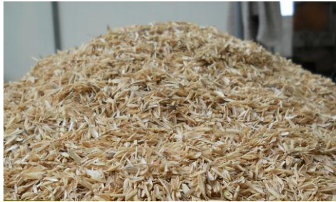
Fig. 1. Rice husks waste.

Rice husks fibers were obtained from a local rice mill factory. Fig. 1 is the waste of rice husks around a factory that might contain many impurities such as sand, dust, bran rice, and other small particles. The research was started by selecting the rice husk waste which has average size of 7 mm length \times 1.5 mm width \times 0.2 mm thickness as shown in Fig. 2. The selected rice husks were cleaned by washing with fresh water and dried under the sun. The fibers then were soaked in 5% NaOH solution in water bath for 2 hours. The treated fibers were rinsed in fresh water to neutralize the effect NaOH, and left to dry naturally at room temperature.